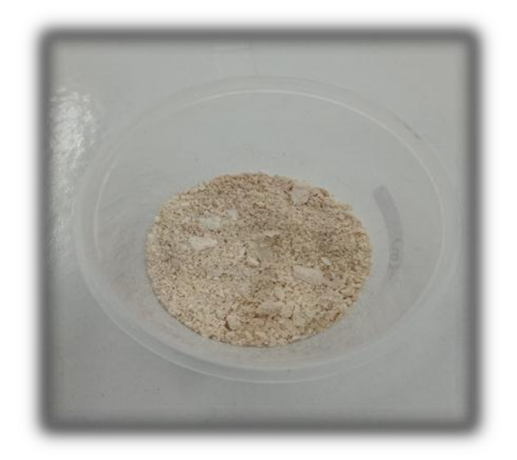
Fig 1. Catechin powder produced

The value of catechin content obtained in the analysis of catechin powder is 94.26%. This level has met the requirements of the Herbal Pharmacopoeia where the catechin content in gambier extract is of high quality 1 should not be less than 90% (Addiena, et al.2019). This shows the catechin powder from the leaves of Uncaria gambir Roxb. used are of good quality.