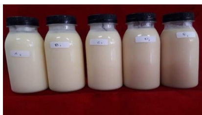
Fig.1. Yoghurt with tamarillo juice addition research results

According to Astawan (2008) [11], anthocyanins found in tamarillo are a group of reddish-colored dyes that are soluble in water and can be used as food and beverage dyes. In addition, the color of tamarillo yoghurt is also determined by the raw milk used. According to [12], milk has a white to yellowish color, depending on the type of animal, feed, fat content, and solids contained in milk.